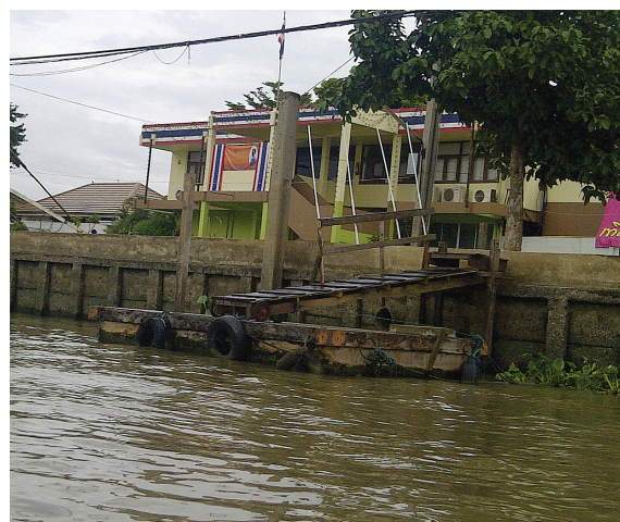
Front of the government-run Kredtrakarn Protection and Occupational Development Center on Koh Island, accessible only by boat.