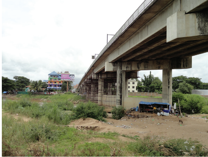
Thai-Burma Friendship Bridge over the Moei River, connecting Mae Sot to Myawaddy, Karen State.