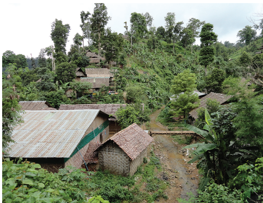
Ban Mai Nai Soi refugee camp.

Through a formal partnership, the Karenni National Women's Organization (KNWO) and the International Rescue Committee (IRC) jointly operate two shelters, referred to as Women's Community