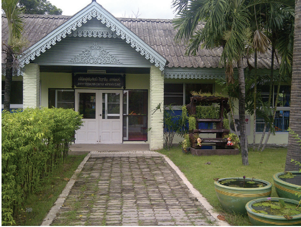
The Jimmy and Rosalynn Carter Women's Clinic at APSW's Emergency Home, in the Bangkok area, provides basic and maternal health care to shelter residents on-site.