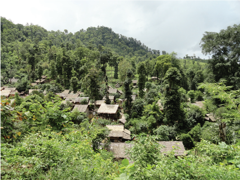
Ban Mai Nai Soi refugee camp.

In response to a series of Burmese military cross-border attacks, the Thai government consolidated the settlements into nine secure camps. In 1999, the MOI established Provincial Admissions Boards