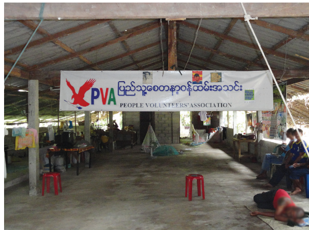
The People Volunteers’ Association’s safe house is available to any migrant in need of temporary protection, including men and boys, in Mae Sot.

When asked about services for men and boys, many shelter providers within and outside the camps stated that sexual and gender-based violence against men and boys does not occur there and that “rape happens only to women.” However, one provider who operates a shelter for migrants in Mae Sot that is open to men noted that he frequently sees cases of sexual violence and exploitation of men. He understands that the violence is often perpetrated by male employers, frequently in exchange for employment or wages in some factories in the Mae Sot area. A key challenge for male survivors, he explained, is that they are not aware that they can report their cases and receive support: