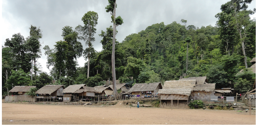
Homes in Ban Mai Nai Soi refugee camp.

Even when there was a designated safe house security guard or they were located in close proximity to camp security, providers explained that they often did not feel either the shelter staff or the residents were safe because the camp security staff lacked the necessary training and equipment to protect them.