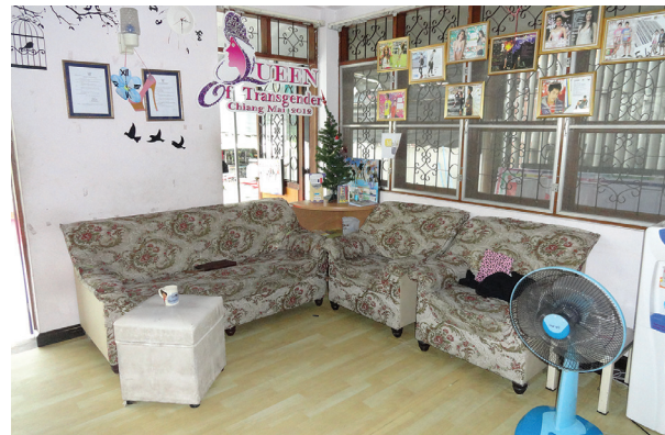
The living room at the MPlus Foundation’s drop-in center offers a safe, comfortable space for MSM and transgender men to receive counseling and HIV prevention education. Note: This program has moved to a new location.

No safe shelter services designed to meet the needs of the LGBT population were identified in the areas visited by researchers. However, the MPlus Foundation, a Thai NGO in Chiang Mai with a focus on HIV prevention, operates a drop-in center for men who have sex with men (MSM) and transgender men. Although the center primarily serves Thai men, it also serves some migrants from Shan state, many of whom are involved in sex work. Many of their clients have experienced relationship violence, verbal and emotional abuse by the public, and violence by the police. The drop-in center is intended to serve as a second home to this community, providing a safe space where clients can receive counseling, free HIV tests, and condoms, and rest during the day. This program can be considered an alternative purpose entity because in some instances, clients have stayed for one or two nights; however, the center was not designed to provide for overnight stays.