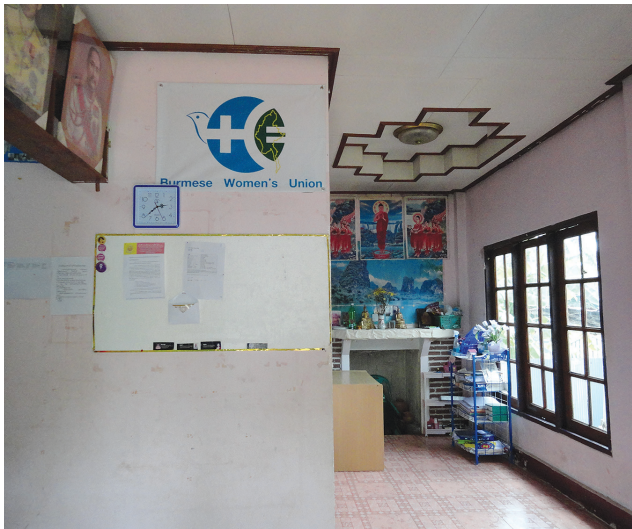
Behind BWU's shelter, a separate community center included a library and gathering space for women to socialize, improve literacy skills, and participate in monthly discussions.

Mae Sot area also serves as the hub for organizations addressing displacement, with an estimated 180 NGOs and CBOs providing services within the camps or to migrants in the Mae Sot District. 133