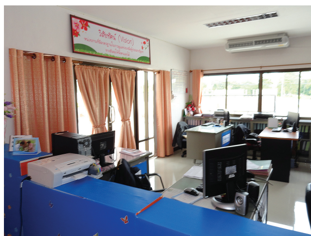
On-site office space for government social workers, administrators, psychologist, and other staff at the Tak Emergency Shelter for Families and Children.

Human Rights Center researchers visited the Tak Emergency Shelter for Families and Children, the government-run shelter nearest Mae Sot and the only public shelter in Tak Province. This mainstream shelter provides