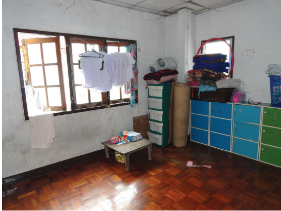
Bedroom at one of SAW's shelters serving migrant women and girls seeking protection from SGBV.

“There are some cases that we are worried about a lot. So there are some times that we still worry about them even though we return home from work.”