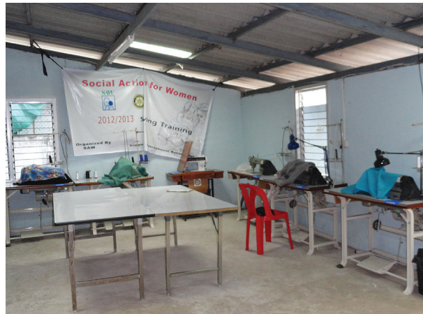
Sewing training room for residents of SAW’s Green Hope Center and Women’s Crisis Center.

Migrant residents expressed appreciation for any opportunities to work at the shelter, such as sewing and weaving items to sell to other members of the migrant community so that they can earn income without fear of arrest by the police or further workplace exploitation. Shelter staff pointed out the importance of vocational training and assisting residents in finding work assignments in the transition process, as most survivors do not want to return to the community or work site where the incident of sexual and gender-based violence occurred. A few residents reported that receiving guidance from shelter staff to identify safer work sites with less reported abuse and exploitation was a helpful strategy. One resident emphasized that the provision of small loans for residents to start their own businesses would be especially helpful in the transition process.