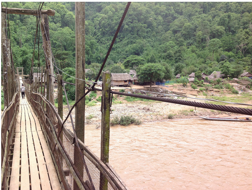
Bridge through Mae Ra Ma Luang refugee camp.

According to key informants, domestic violence, often perpetrated by husbands using alcohol, is the most common form of sexual and gender-based violence in Mae Ra Ma Luang. Rape, particularly of