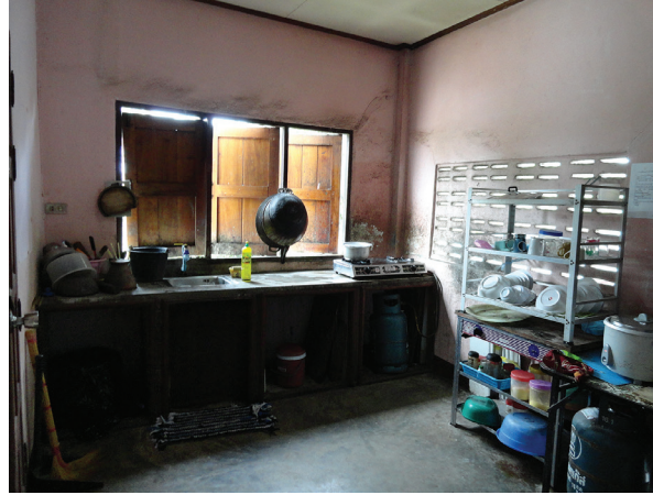
Bedroom and communal kitchen at BWU's Women's Resource and Empowerment Center for migrant women and girls seeking protection in Mae Sot.

understood, and camp leaders and community members generally consider certain levels of domestic violence to be acceptable unless a survivor has been seriously physically injured. Because of the attitude that domestic violence is not a serious issue, section leaders in Ban Mai Nai Soi often try to mediate issues on their own rather than refer women to shelter or other services. 143