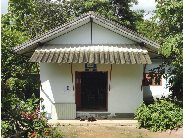
Entryway to the shelter area of BWU's Women's Resource Empowerment Center. Note: This program has closed.