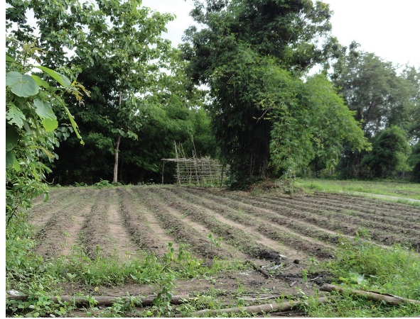
Field next to the People Volunteers' Association's safe house where agriculture is produced on-site to support shelter residents.

Some key informants noted that limited funding for sexual and gender-based violence services overall seemed to inhibit collaboration in the refugee camps and cause conflicts related to case management.