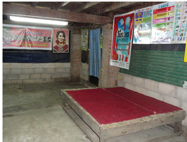
Downstairs area of the Overseas Irrawaddy Association’s shelter serving migrants in Mae Sot where men sleep.

Resource constraints place a significant burden on providers of shelter for the Burmese migrant community in those shelters run by CBOs and NGOs. Some staff members responsible for case management indicated that it was difficult to manage their workload and having additional staff would help to meet residents’ various needs. Many of the CBO-run shelters compensate staff according to the available budget, which can fluctuate over time. One provider, who explained that her salary was recently reduced to 3,500 baht (approximately US$119) per month, 153 explained that she can no longer afford to work at the shelter despite her love for the work: