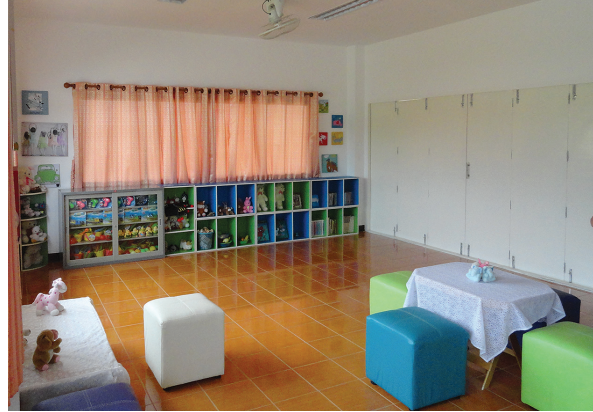
Women's bedroom and children's play room at the government-run Tak Emergency Shelter for Families and Children.

under their care. Restrictions on the movement of undocumented migrants also require government providers to obtain approval to transport some migrants in need of assistance to new areas, which can add a further challenge. A number of shelter providers also explained that when they are unable to accommodate individuals, they do not refer them to government shelters. Some perceived reluctance on the part of government shelter providers to serve the Burmese population.