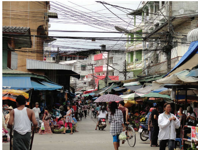
Market area in Mae Sot.

said their child had been a victim. 104 Among those who reported abuse, 64 percent had taken no action, 24 percent protected themselves, and 12 percent reported it to relatives or community leaders. 105