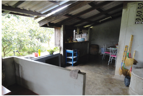
Bedroom and communal kitchen in Compasio's short-term Emergency Shelter for migrant women and girls with protection needs.

own undocumented status. One staff member who lives on-site at a shelter that serves migrants in Mae Sot explained that she and her co-worker often feel afraid, particularly at night: