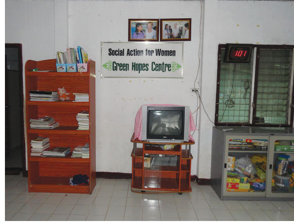
Living room of SAW's Green Hope Center serving migrant women and girls in Mae Sot who have experienced SGBV.

Access to educational services for their children was a priority to the shelter residents we interviewed. Some providers and key informants emphasized the importance of sending migrant children to Thai schools rather than providing educational services on-site as a key strategy to link migrant youth to Thai systems.