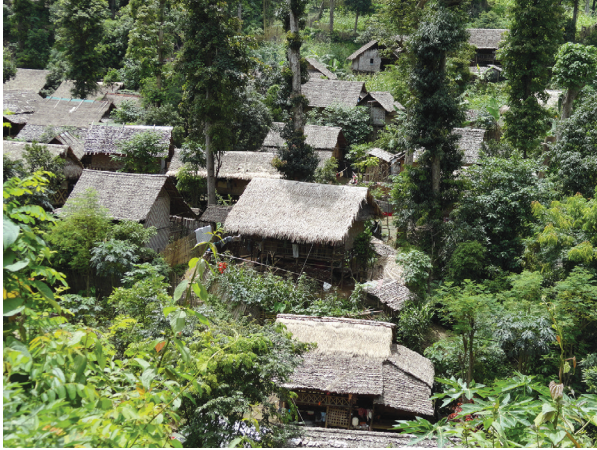
Homes in Ban Mai Nai Soi refugee camp.

ership. Section leaders expressed that they would like WCC staff to inform them whenever they admit a survivor to their shelter; however, in the interest of confidentiality, this has not been made part of the shelter protocol followed by staff. Section leaders indicated that they were only willing to assist with the transition process and safety monitoring of shelter residents returning home to their sections if they were kept informed about cases from the beginning of the process.