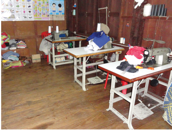
Sewing room at the Overseas Irrawaddy Association's shelter where residents produce mosquito nets and other items as income-generating activities for the shelter.