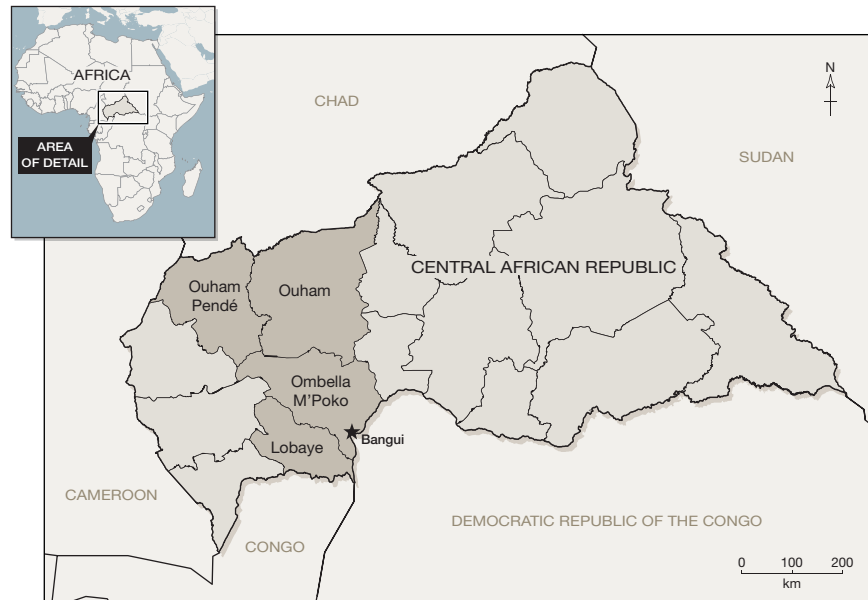
Figure 1. Sampled Prefectures in the Central African Republic

could not be contacted after 3 attempts (85), the household was empty (90), all eligible individuals refused (73), no one was eligible in the household (48), or other reasons (17). Within the 1879 households, interviewers approached 1969 individuals, of whom 1879 were interviewed (1 per household; response rate, 95%). A total of 90 selected individuals were replaced because they were away and could not be located after 3 attempts (48), they refused to participate (28), or other reasons (14) (Figure 2).