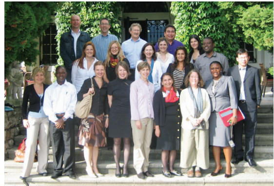
Participants convene at the Outreach and International War Crimes Tribunals workshop