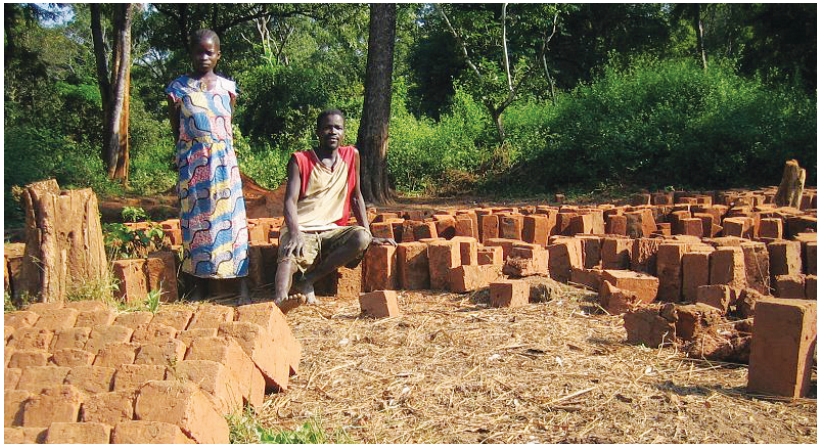
Most citizens in northern Uganda have returned home from IDP camps and are now in the process of rebuilding