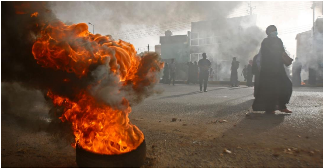
Protesters walk by burning tires in Khartoum on June 3, 2019.