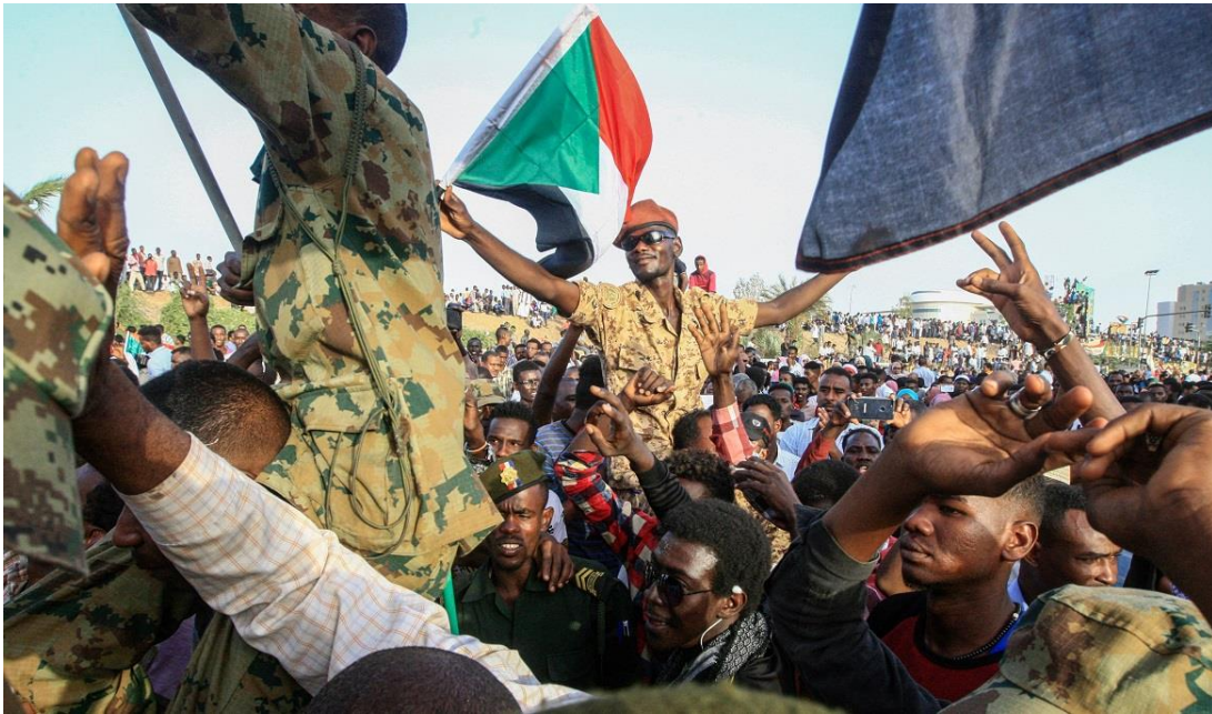
Sudanese protesters carry soldiers, including Rapid Support Forces (RSF) in trademark red caps, during a rally outside Khartoum's army headquarters in April 2019. In the months before the June 3 massacre, interviewees told PHR that protesters and RSF soldiers had positive interactions.